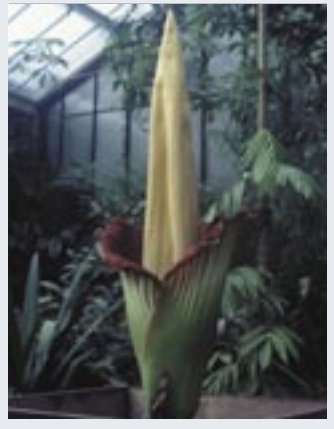
The giant titan lily, here pictured at Kew, is an endangered plant.

Botanical gardens provide a safe haven for 9,000 endangered plants species – a quarter of the total number of plants known to be threatened globally. Botanic