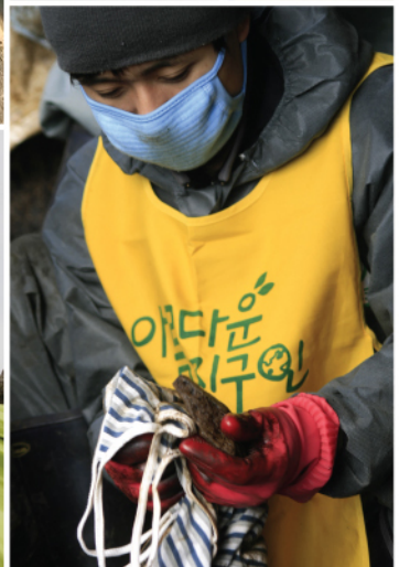
포터 한국민 재생동아를 체험인과 2008~2009 국립과서 재생동아를 모두 소개합니다. 책을 만드는 사람들이 책을 읽는 사람들이 힘을 모아 지구에 다. 연인들에게는 아주 귀한 선물입니다. 이 책은 당신의 마음을 따뜻하게 데워 * 2010년 1월 10일 - 서울 - 국립과서 재생동아를 소개하는 방송을 진행합니다.